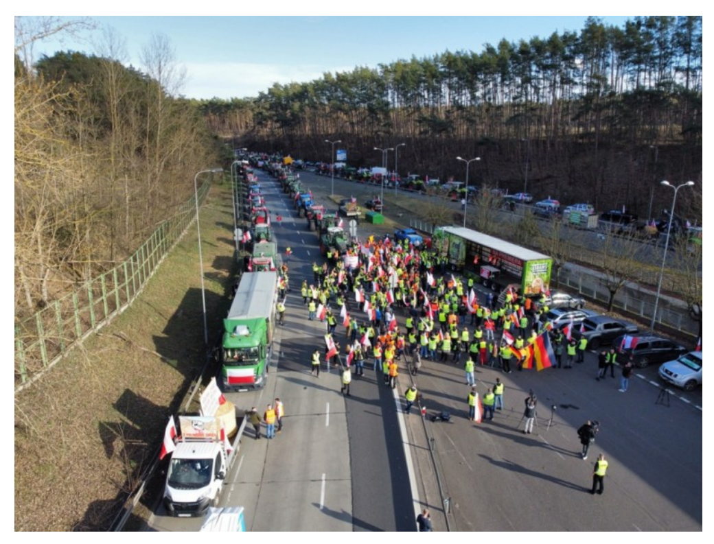
<u>Major escalation: Polish farmers block Germany's vital A2 Autobahn</u>

<u>Austria: 3 sex workers brutally murdered by Afghan migrant in Vienna brothel</u>