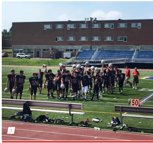
The principal said he was disgusted by the vandalism.

The state mandate was put in place so transgender and intersex students would have menstrual products available if needed, CT Insider reported.