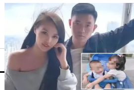
Chinese man, mistress executed for throwing his two young kids out apartment window so they could start a new family together: report