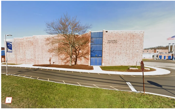
Brookfield High School was faced with the vandalism last week.