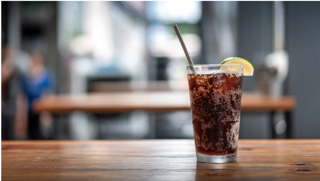
Aspartame is a common artificial sweetener often used in diet sodas.

By Chantelle Pattemore on July 14, 2023 — Fact checked by Dana K. Cassell