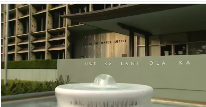
With water conservation top of mind, BWS hopes to inspire change in youth through art