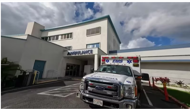
Windward Oahu's major hospital now able to treat certain trauma patients