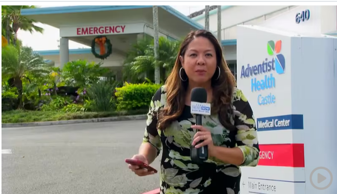
Windward trauma center gets an upgrade, adding much needed support to Oahu ER services