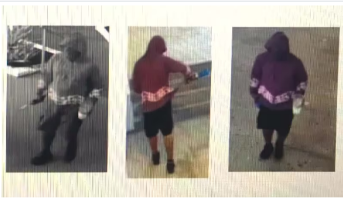
Man sentenced for dousing victim with gasoline, lighting him on fire