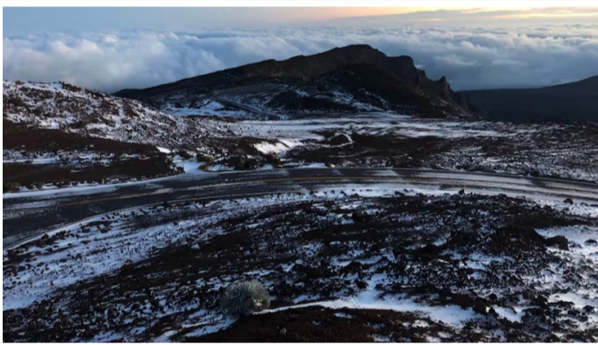
Winter storm warning issued for Haleakala summit; winds to 100 mph forecast for Big Island peaks